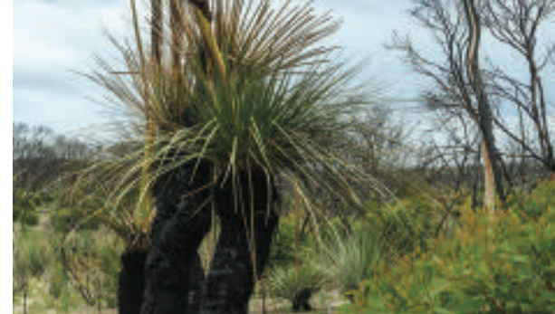
CLOCKWISE FROM ABOVE: The KIWT Fire Recovery Experience bursting with new life and captured in December 2020; The landscape is continuing to regenerate and thrive; Echidnas rule the roost on the KIWT. OPPOSITE: Detour to the weather-sculpted Admirals Arch on day two of the trail.