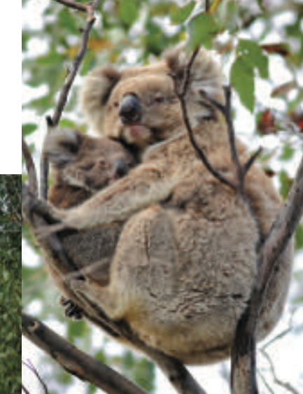
CLOCKWISE FROM LEFT: KIWT traverses the same stretch of dramatic coastline as the site of Southern Ocean Lodge, overlooking Hanson Bay; Walking the Fire Recovery Experience – photographed here in December 2021 and evolving constantly – helps pave the way for future walkers; Spot koalas in the crook of a branch; New growth is springing up everywhere.

HIGH ABOVE ME, THE GHOSTLY WHITE limbs of sugar gums stand out starkly against a pale blue sky. Each one is attached to a slender trunk shrouded in tufts of greenery that threaten to hide it completely while at ground level spiky acacia, bracken and vivid pink bottlebrush close in around me so densely that I sometimes need to push them aside to find the path ahead. Some walking trails deviate to avoid fallen trees, but as I forge ahead I find myself regularly detouring around trees that are growing too quickly. It would appear the reports of Kangaroo Island's demise have been greatly exaggerated.