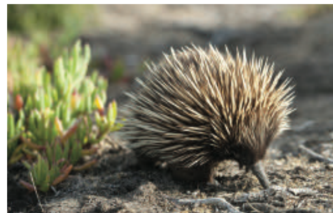
PHOTOGRAPHY: TOURISM AUSTRALIA (ADMIRALS ARCH); AUTHENTIC KANGAROO ISLAND (ECHIDNA, PINK WILDFLOWERS); DEPARTMENT FOR ENVIRONMENT AND WATER/HEIDI WHO PHOTOS (KIWT FIRE RECOVERY EXPERIENCE); HEIDI WHO PHOTOS (PURPLE WILDFLOWERS)

Along with the promise of a comfortable bed at the end of each day, one advantage of experiencing the trail as a series of day walks is the chance to see sections of the park that the hike doesn't cover and I watch from the front seat as the winding ribbons of tarmac fringed with brightly coloured wildflowers unspool invitingly ahead, each gentle slope providing a new reveal. But speeding through the park in silence also reminds me of what I'm missing; the tinkling call of rosellas, the ceaseless roar of the ocean and the deep, twanging call of banjo frogs hiding in the reeds. It makes me impatient for the next day, to see what other revelations await on this trail that continuously defies expectations. AT →