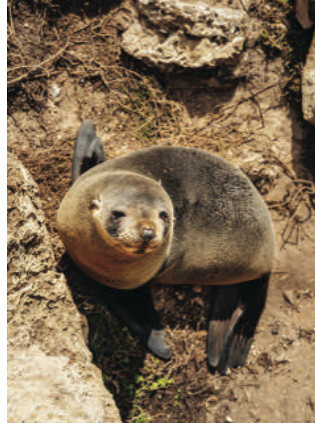
CLOCKWISE FROM LEFT: Face to face with a fur seal at Admirals Arch; The road that snakes through Flinders Chase National Park captured in 2021 – the landscape is changing every month; The island's namesake kangaroos are bouncing back; Cape Du Couedic, with its distinctive lighthouse, serves as the pick-up point on day two of the KIWT Fire Recovery Experience. OPPOSITE: The KIWT affords new perspectives on Kangaroo Island's iconic Remarkable Rocks.

Owner Mark Jago jokes that the incredibly thick regrowth at the caravan park, set on 17 hectares of bush and grassland, means that "people see more wildlife here than in the national park". As if to prove his point, I walk past a couple staring upwards a few metres from the campervan and follow their gaze to see a plump koala holding its baby in the crook of a branch. Even after the fires there are twice as many koalas as humans here and the island's namesake marsupials are more →