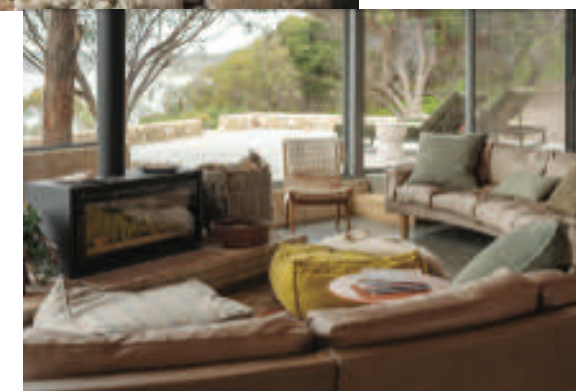
CLOCKWISE FROM ABOVE: Check into Dune House at Hamilton & Dune for some post-trail luxury; Relax in its sunken lounge; Don't miss a stop at Kangaroo Island Spirits; For a botanical-infused cocktail; Dune House overlooks Emu Bay; Enjoy epic sunsets from Oceanview Eco Villas. OPPOSITE: Hidden Stokes Bay is a scenic spot for a dip.

When the new Southern Ocean Lodge reopens, it will be the most visible monument to Kangaroo Island's resilience and optimism. But it's just one of many signs that life is moving forward on this remarkable island.