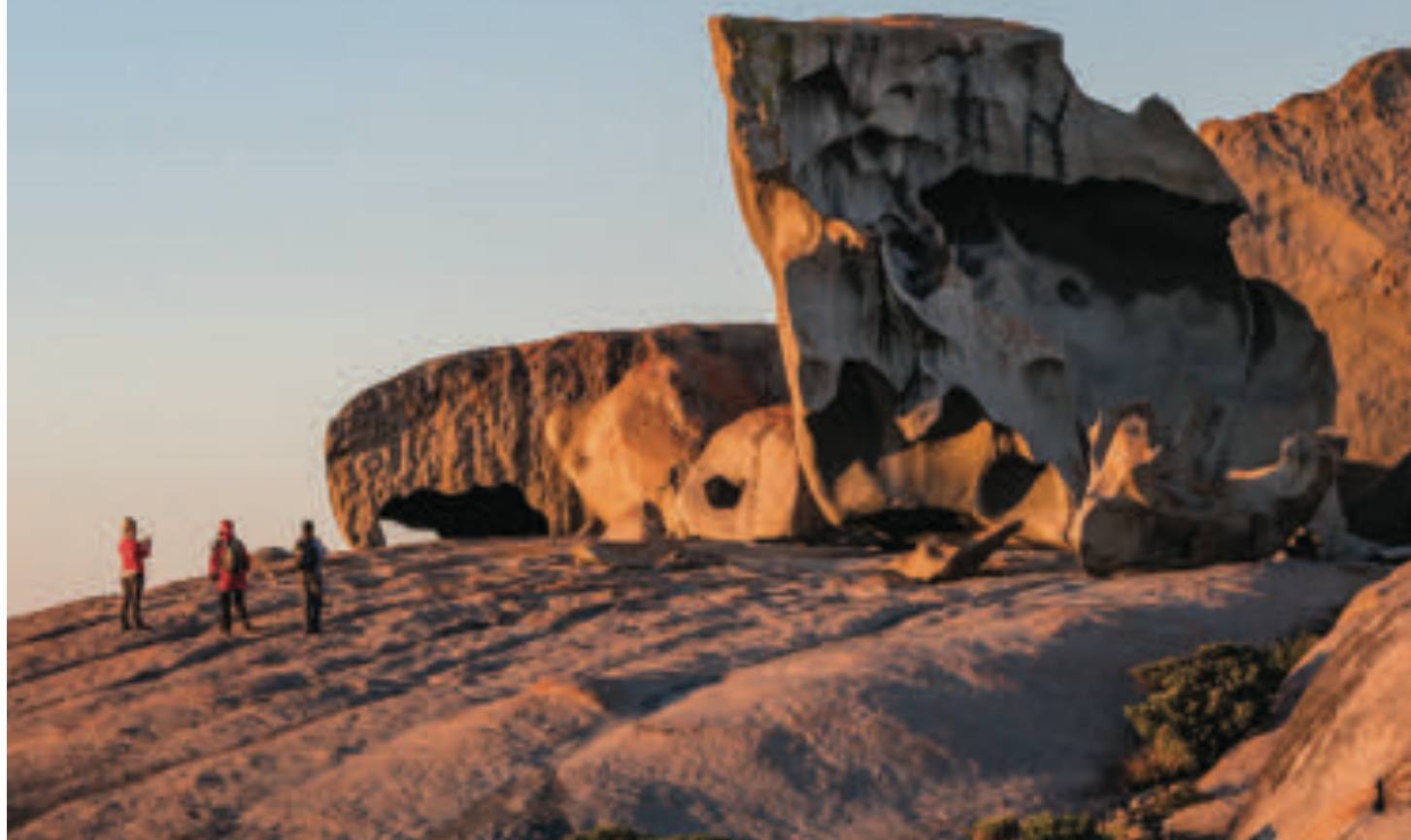
PHOTOGRAPHY: HEIDI WHO PHOTOS (REMARKABLE ROCKS); TOURISM AUSTRALIA (FUR SEAL, FLINDERS CHASE NATIONAL PARK, CAPE DU COUEDIC LIGHTHOUSE)

Leafless mallee trunks point skyward like worshippers frozen in place mid-prayer, but a profusion of new growth sprouts from the base of each plant, providing vital shelter for smaller animals and food for larger ones.